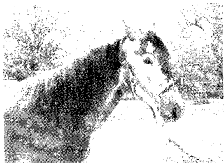
MARE born 05/01/05